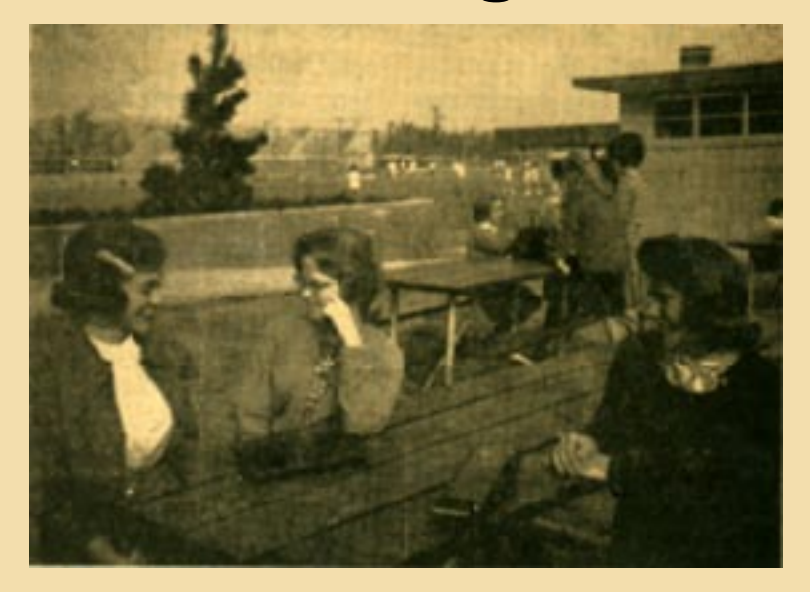
TEENAGE MISS TALKS WITH FRIENDS DURING LUNCH

Blouses, Skirts, Sweaters, Capri Sets Come In and See 206 E. Baseline